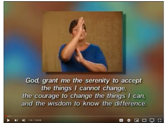
Screen shot from ASL Version of LWB

Virtual meetings that are accessible may also wish to consider cooperating with service bodies that are attempting to build relationships with organizations that provide services to addicts with additional needs.