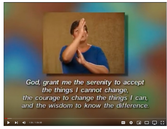
Screen shot from ASL Version of LWB